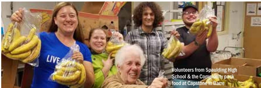
Volunteers from Spaulding High School & the Community pack food at Capstone in Barre

This financial overview details how the contributions raised in the 2015-16 Community Campaign were invested in FY2017. This information was excerpted from our audited financial statements for the year ended June 30, 2017, which are available upon request. Green Mountain United Way does not charge membership dues nor does it use professional fundraisers. A service charge is comprised of the yearly management and general cost of 14% and the yearly fundraising cost of 7% for a total of 21%. Amount Raised: see Financial Statement under INCOME, Campaign line. Sources of contributions: individuals in the public at large, business campaigns, corporate gifts, special events. Administrative costs are covered by deducting a service charge percentage from donations (see Administrative Expenses).