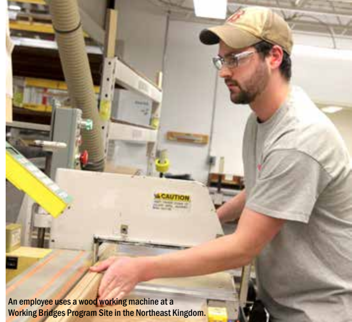
An employee uses a wood working machine at a Working Bridges Program Site in the Northeast Kingdom.

This financial overview details how the contributions raised in the 2015-16 Community Campaign were invested in FY2017. This information was excerpted from our audited financial statements for the year ended June 30, 2017, which are available upon request. Green Mountain United Way does not charge membership dues nor does it use professional fundraisers. A service charge is comprised of the yearly management and general cost of 14% and the yearly fundraising cost of 7% for a total of 21%. Amount Raised: see Financial Statement under INCOME, Campaign line. Sources of contributions: individuals in the public at large, business campaigns, corporate gifts, special events. Administrative costs are covered by deducting a service charge percentage from donations (see Administrative Expenses).