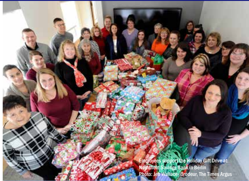
Employees support the Holiday Gift Drive at Northfield Savings Bank in Berlin